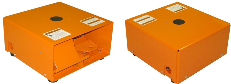
Front and back views, shown with optional gate (-GT) on left side.

Warning: To avoid personal injury, do not use foot switches on machinery lacking effective point-of-operation safeguards. Disconnect input power before installation or maintenance.